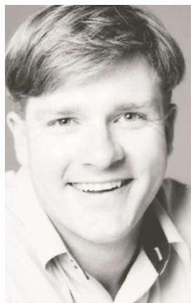
Parks Victoria Ranger

Hayes Walk will take you from close to the heart of Foster over Kaffir Hill and past the site of Victory Mine, Foster's largest gold mine. By crossing McDonald Street, you can continue on to the Cody Gully Walk, which forms part of the Bratuaulong Walking Track.