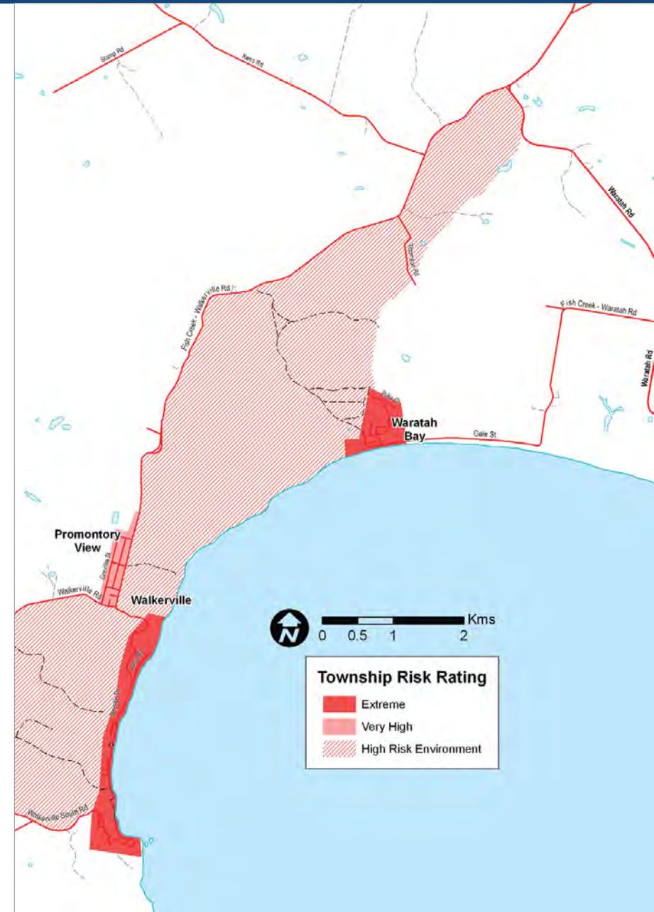
Waratah Bay Risk Assessment – Victorian Fire Risk Register, November 2010